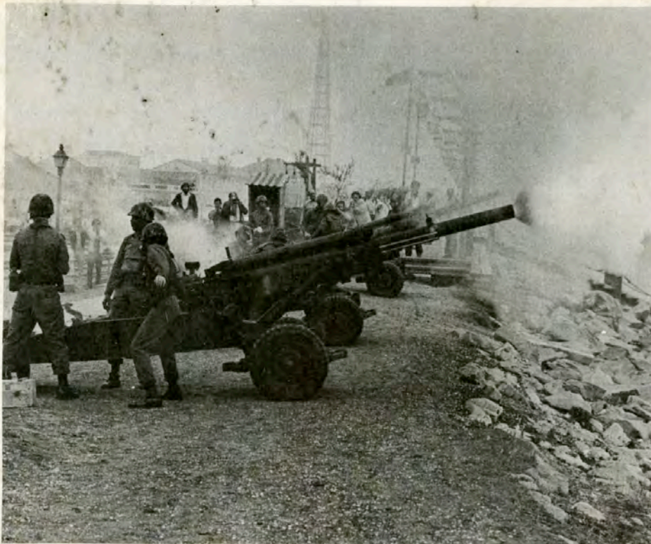
FIRE! —Members of the Washington Artillery fire a 21gun salute as part of ceremonies commemorating the Battle of New Orleans. Each year members of the WA take part in the commemoration of the battle which saved New Orleans from the British during the War of 1812.