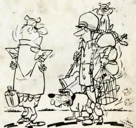
"I couldn't get anybody to watch them for two weeks so I had to bring them to camp with me."