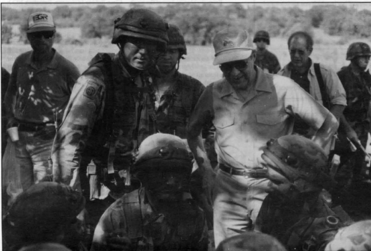
BEST OF THE BEST-- Secretary of Defense William Perry (with baseball cap) visits with the 2nd Armored Division Commander and the 256th Infantry Brigade soldiers during Annual Training 1995 at Fort Hood, Texas.