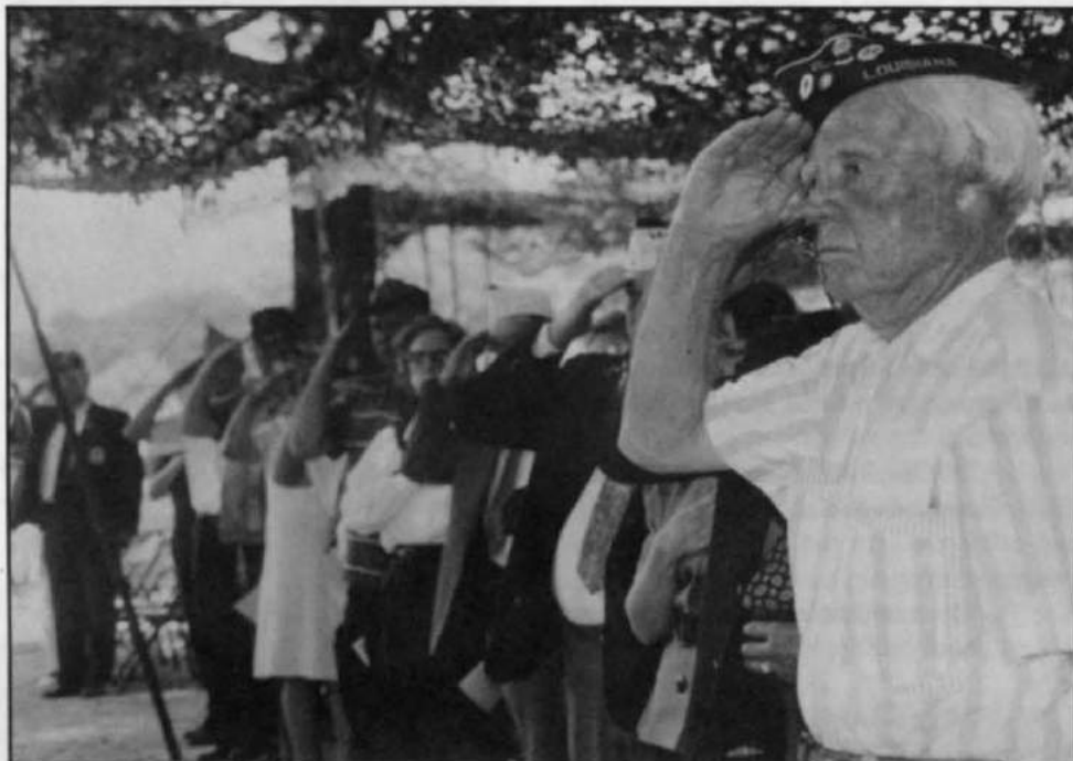
SALUTES-- Veterans of all ages from all over the state joined at Camp Beauregard to remember and help celebrate the 50th Anniversary of WWII. A grateful nation truly remembers.

"With all its horror and sacrifice, World War II was a special time in history,"